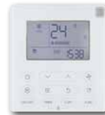
Optional Wired Programmable Controller 17317100001195

2 Oil traps should be installed every 16.5 to 23 feet (5-7m) when the outdoor unit is installed above the indoor unit